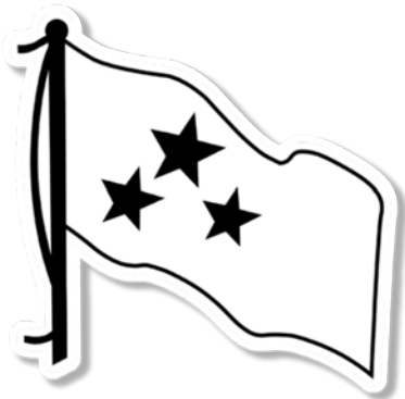
CPI(ML) Liberation [CPI(ML)L] Election Symbol: Flag With Three Stars

DEFEAT BJP SAVE DEMOCRACY VOTE FOR CPI(ML) ELECT INDIA CANDIDATES