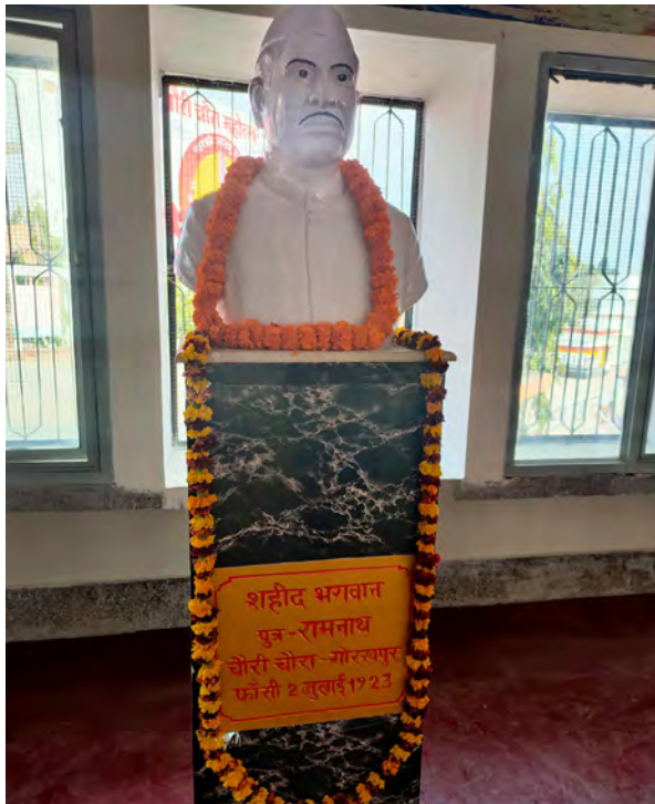
Surname missing from Bhagwan Ahir bust

The Memorial gives the date all the martyrs were hanged as 2 July 1923, which is incorrect. The martyrs were hanged in different jails on different dates between 2 and 11 July 1923. There is