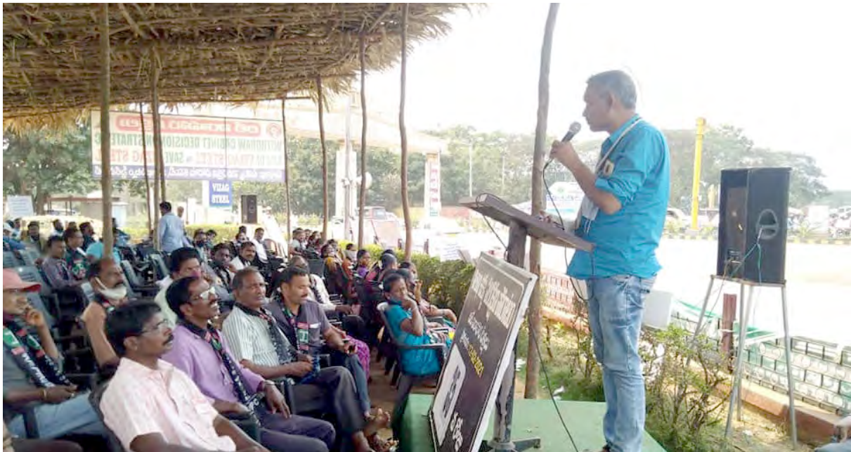
AICCTU Team Visits Vizag : Workers From Bhilai & Bokaro Steel Plants Express Solidarity With Protesting Workers Of Vizag Steel Plant